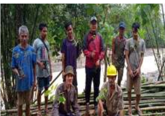
The YSHL team and residents planted planting on the banks of the Selang Pangeran river, one of the locations affected by the flood in December 2020.