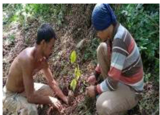
One of the tree planting activities in Lau Damak Village as well as taking the coordinates of the planted trees using GPS.