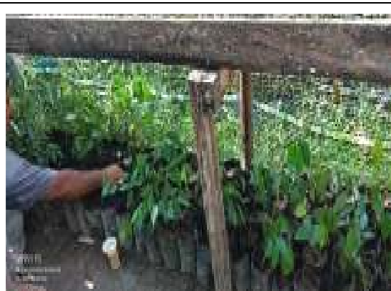
Seedlings from nature being sown to provide seedlings for tree planting activities in Selayang Hamlet.