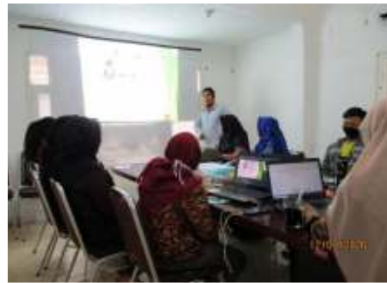
The Director of YSHL is giving material about the skills that must be prepared to be a good facilitator at YSHL's office in Medan.