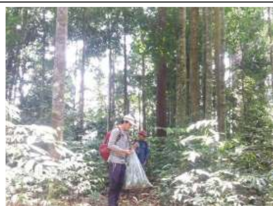
SHL staff and volunteers are collecting extracted seeds from nature in the area around Lau Damak Village which borders with GLNP.