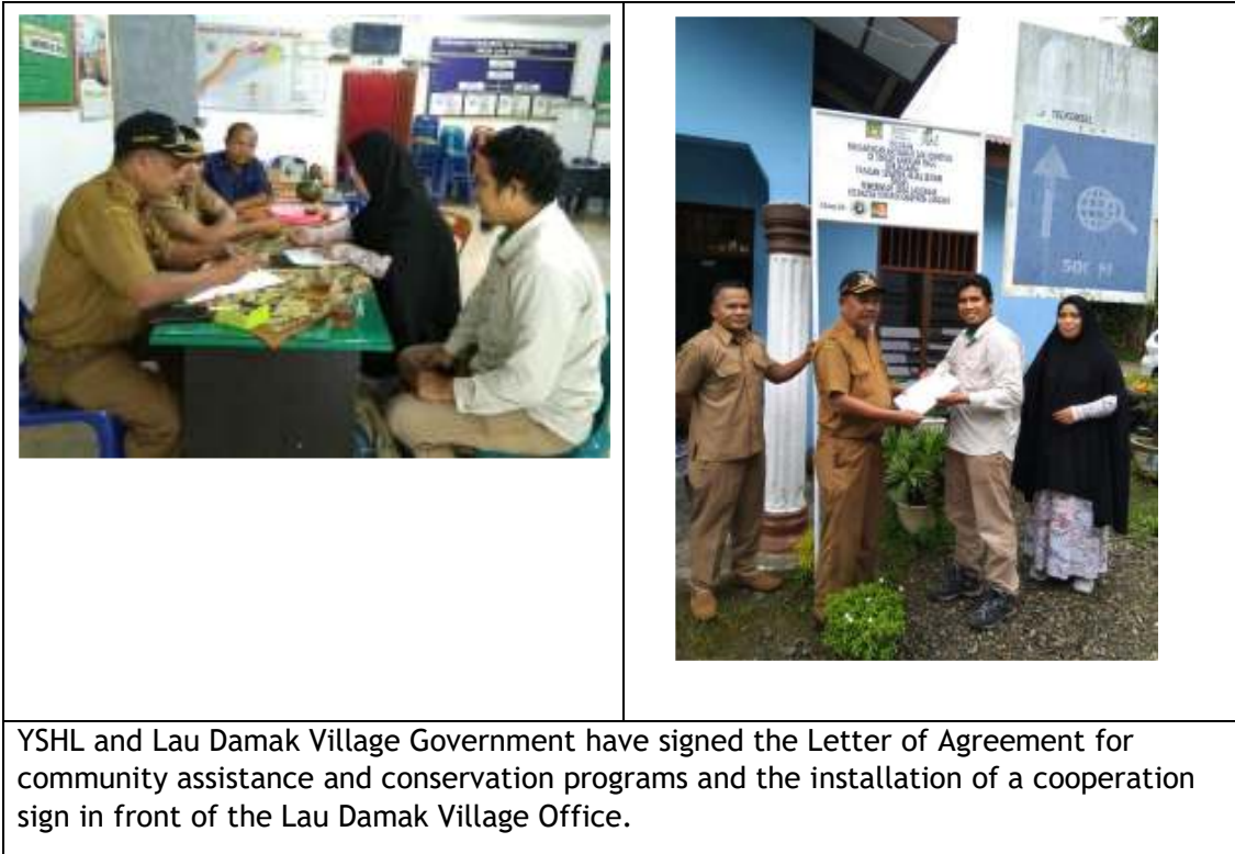
YSHL and Lau Damak Village Government have signed the Letter of Agreement for community assistance and conservation programs and the installation of a cooperation sign in front of the Lau Damak Village Office.