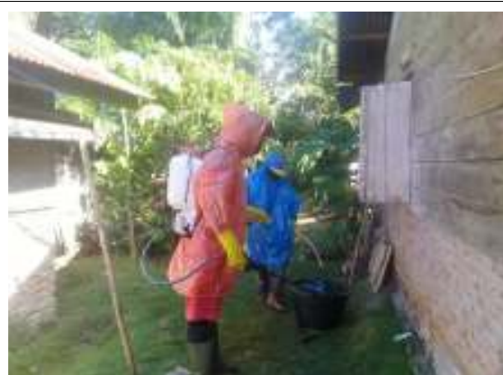
One officer from the village was spraying people's homes in Lau Damak Village in April.