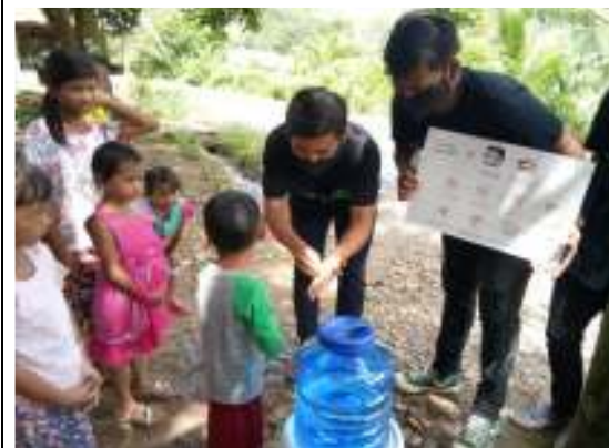
The involvement of Sahabat Hijau members in educational activities about the prevention of COVID-19 for children in Batu Jongjong Village.