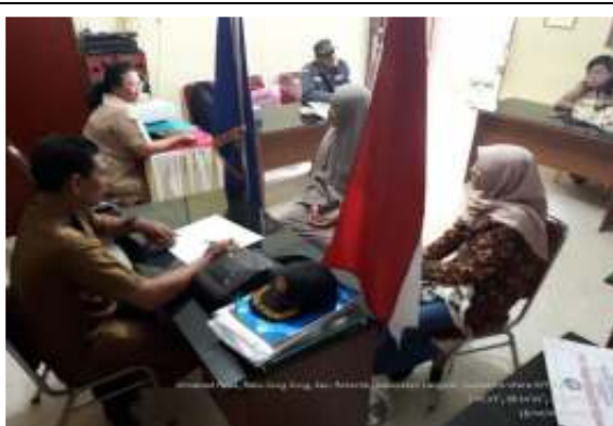
Discussions with the principal and signing the MoU for environmental education activities at SDN Batu Jongjong in January 2020