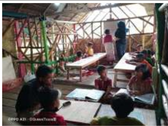
The condition of the renovated upper floor of the learning house in Batu Jongjong Village equipped with a study table and blackboard.