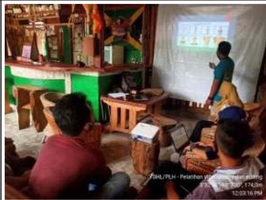
Videography and editing training for members of Sahabat Hijau as capacity building in Bukit Lawang.